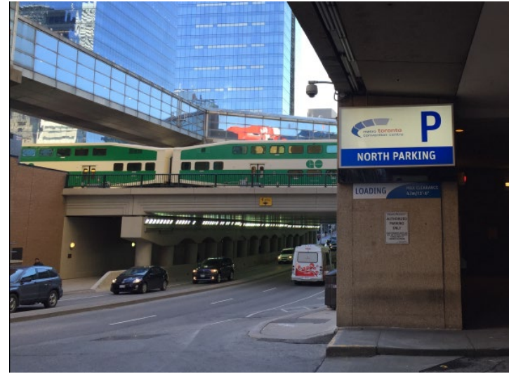
Wall mount signage